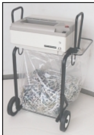
Model 1675-FS Goes anywhere - Fits in car trunk. Convenient 2 piece design. Stand folds flat. Separate handles carry the shredder.