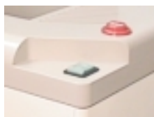
"Quick Stop" Button

HS-High Speed Models Available with 120 Ft/Min. Shredding Speed. Sheet Capacity Drops at higher Shredding Speed.