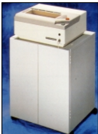
Model 1675-EC Extra large cabinet can hold more shredded paper. Doors swing open to provide easy access to the bag. Optional computer paper shelf.