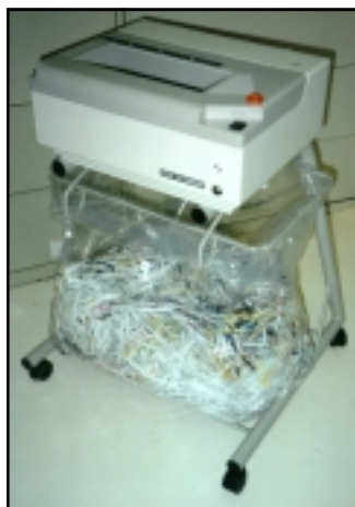
Model 1675-OS Open frame design allows front access. High stability stand made of rolled steel tubing.