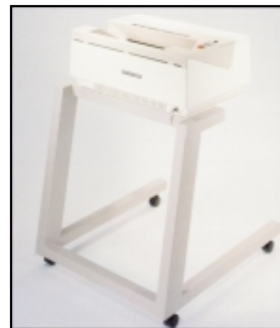
Model 1675-OHC Best suited for mass production shredding. Bag frame uses extra large shred bags. Accepts bailers, large boxes or carts. Custom sizes available.