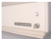
Lock and Key Feature