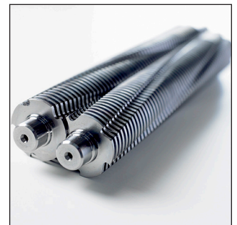
In order to provide slip free power to the cutting cylinders, a steel chain & gears connect the two for maximum capacity.