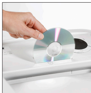
Dahle Professional shredder with built in user-friendly opening for CD/DVD destruction.