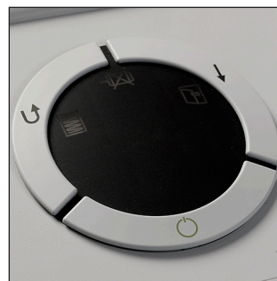
The easy-to-use command dial controls all of the shredder's functions such as power up, reverse, and continuous run.