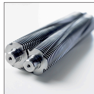
In order to provide slip free power to the cutting cylinders, a steel chain & gears connect the two for maximum capacity.