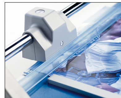
Automatic clamp holds work securely and prevents shifting while trimming.